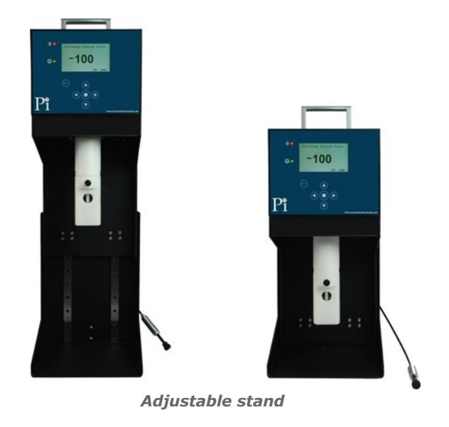
* All subject to change without notice