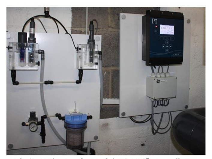
Fig.3 - A picture of one of the CRIUS® controllers installed at Crow Wood Leisure

Crow Wood Leisure in Burnley, UK is a high quality, award winning, private leisure facility running a number of pools and spas. In a drive to increase bathing water quality and to reduce CO_2 emissions, Crow Wood installed two CRIUS® pool controllers (Fig.3) in 2008.