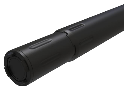
Fig.1: Dissolved Oxygen Sensor - OxySense A

Early measurement of online DO in waste water was made by electrochemical cells that needed sacrificial electrodes, electrolyte, membranes and a lot of calibration. Whilst there are some companies still advocating the use of this technology it was largely replaced in the 1990s and 2000s with online optical measurement. The vast majority of online DO systems used today are optically based similar to the sensor shown in Figure 1.