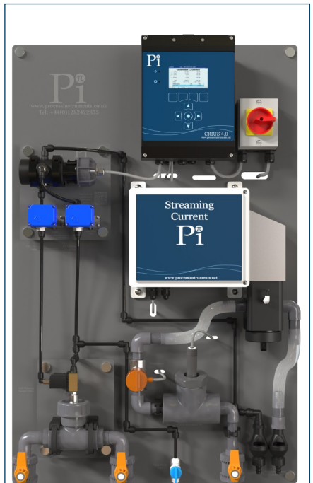
Automatic Coagulation Controller, CoagSense

Flow - available from existing plant flow meter