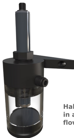
HaloSense sensor in a single closed flow cell