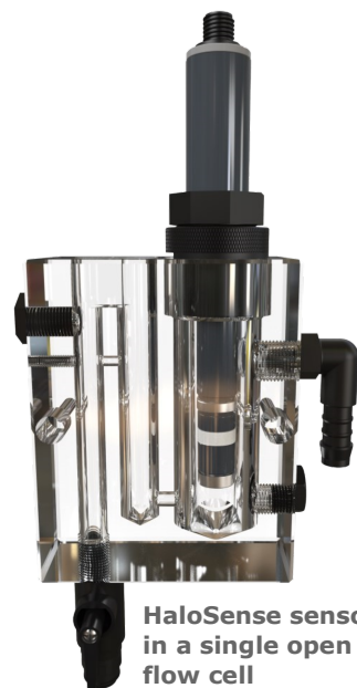
HaloSense sensor in a single open flow cell

The HaloSense sensor is a three electrode chrono amperometric potentiostatic sensor. The free chlorine molecules diffuse through the membrane and come into contact with the electrolyte. The electrolyte has a low pH which converts the majority of the OCl - to HOCl. All the HOCl is reduced at the gold cathode and the resultant ions travel through the electrolyte where they are oxidised at the silver/ silver chloride anode. The current flow is proportional to the concentration of free chlorine in the sample. The anode and cathode are held at the potential difference that provides an optimum catalytic reduction of HOCl.