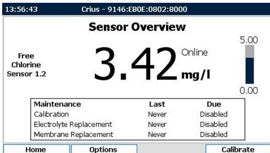
Chlorine Screen Overview