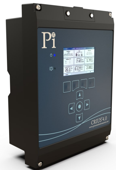
Pi's CRIUS® 4.0 Analyser