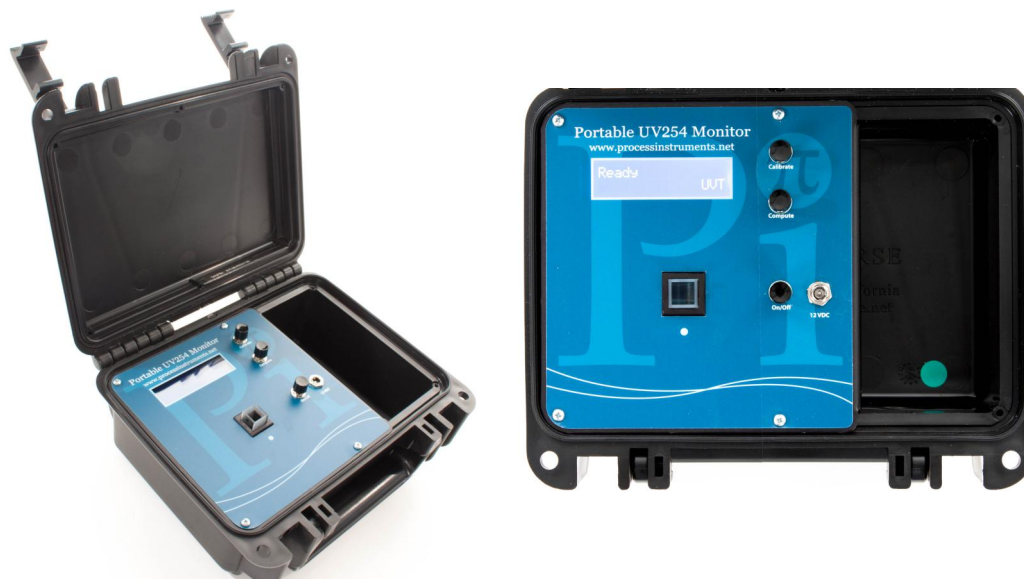
Pi's UV254 Portable

In addition to monitoring UVT in real-time, it is also often necessary to perform UVT testing on grab samples. Pi's UV254Portable is ideal for providing on-site UVT tests of grab samples within a couple of minutes. It can be used for servicing existing UV disinfection systems or for determining UV disinfection design requirements at potential installation sites. The UV254Portable can also be used to validate the performance of Pi's UV254Sense (Water) and UV254Sense (Waste) analyzers.